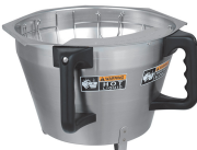
FUNNEL ASSY W/ BASKET, TITAN